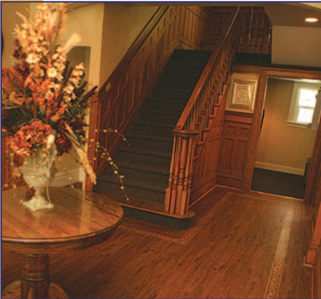
During phase one, the chapter house entryway received new paint, furniture, and polishing.

Do Not Miss This Exciting Opportunity, Send Your Gift Today