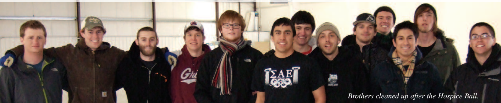
Brothers cleaned up after the Hospice Ball.