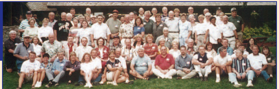
Brothers from the '60s gathered for a 1998 reunion.

Numbers have varied from 50 to 100 attendees that include wives, partners, and friends. Most have been held on a weekend in August at the Marina Cay in Big Fork. It